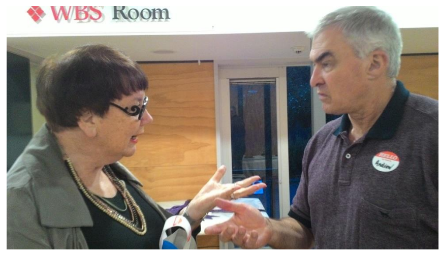
"Four Becks! What's next. The dog as well?"

• We have received a $3575 grant from Greytown Sport and Leisure. We applied for a grant of $1300 to go towards new tablecloths, but as they allocate funds on out operating costs we were eligible for the bigger